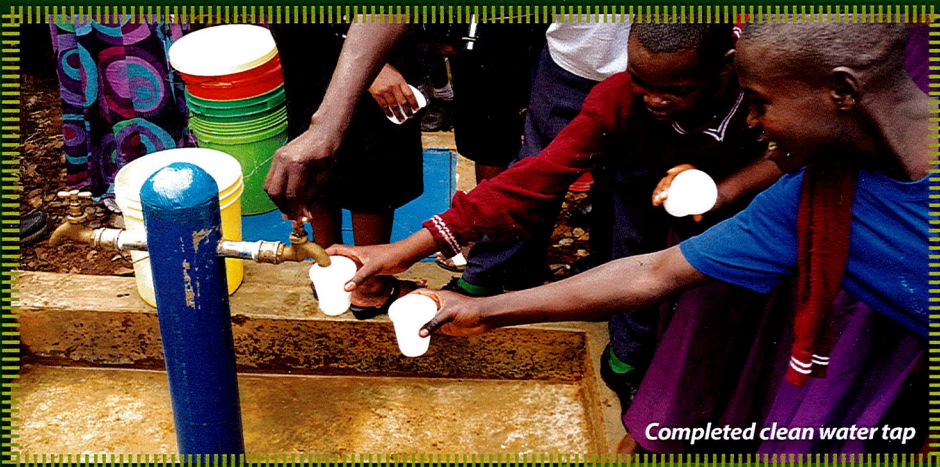
Completed clean water tap